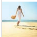
Cover photography (Scottish edition): Photographer: Dennis Flaherty/Getty Images. Location: Val d'Orcia, Tuscany, Italy. Cover photography (rest of world, left): Corbis.