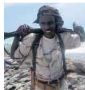
► A pirate stands guard on land to prevent any rescue attempts on a ship held to ransom