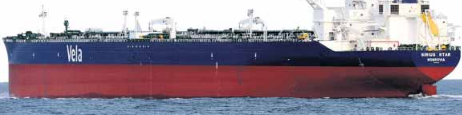
▼ The Sirius Star , taken by Somali pirates on Saturday