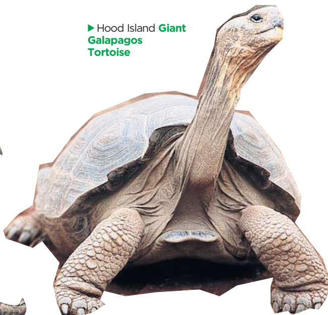
▶ Hood Island Giant Galapagos Tortoise

The Natural History Museum's Darwin exhibition opens this Friday, and continues until April. Read more about the exhibition on page 14