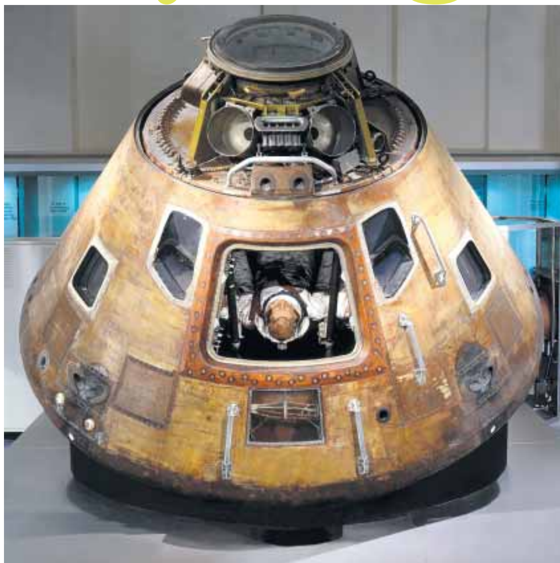
The Apollo 10 capsule came within eight miles of the Moon