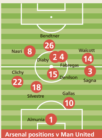
Arsenal positions v Man United