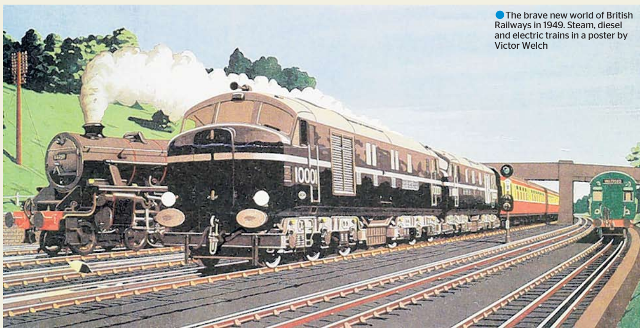
● The brave new world of British Railways in 1949. Steam, diesel and electric trains in a poster by Victor Welch