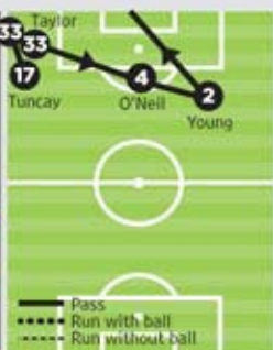
Luke Young Middlesbrough, home to Tottenham Hotspur

After exchanging passes with Shaun Wright-Phillips in his own half, Juliano Belletti , the Chelsea right back, runs to the edge of the D before sending the ball past Chris Kirkland, the Wigan Athletic goalkeeper